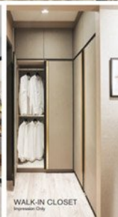
WALK-IN CLOSET Impression Only